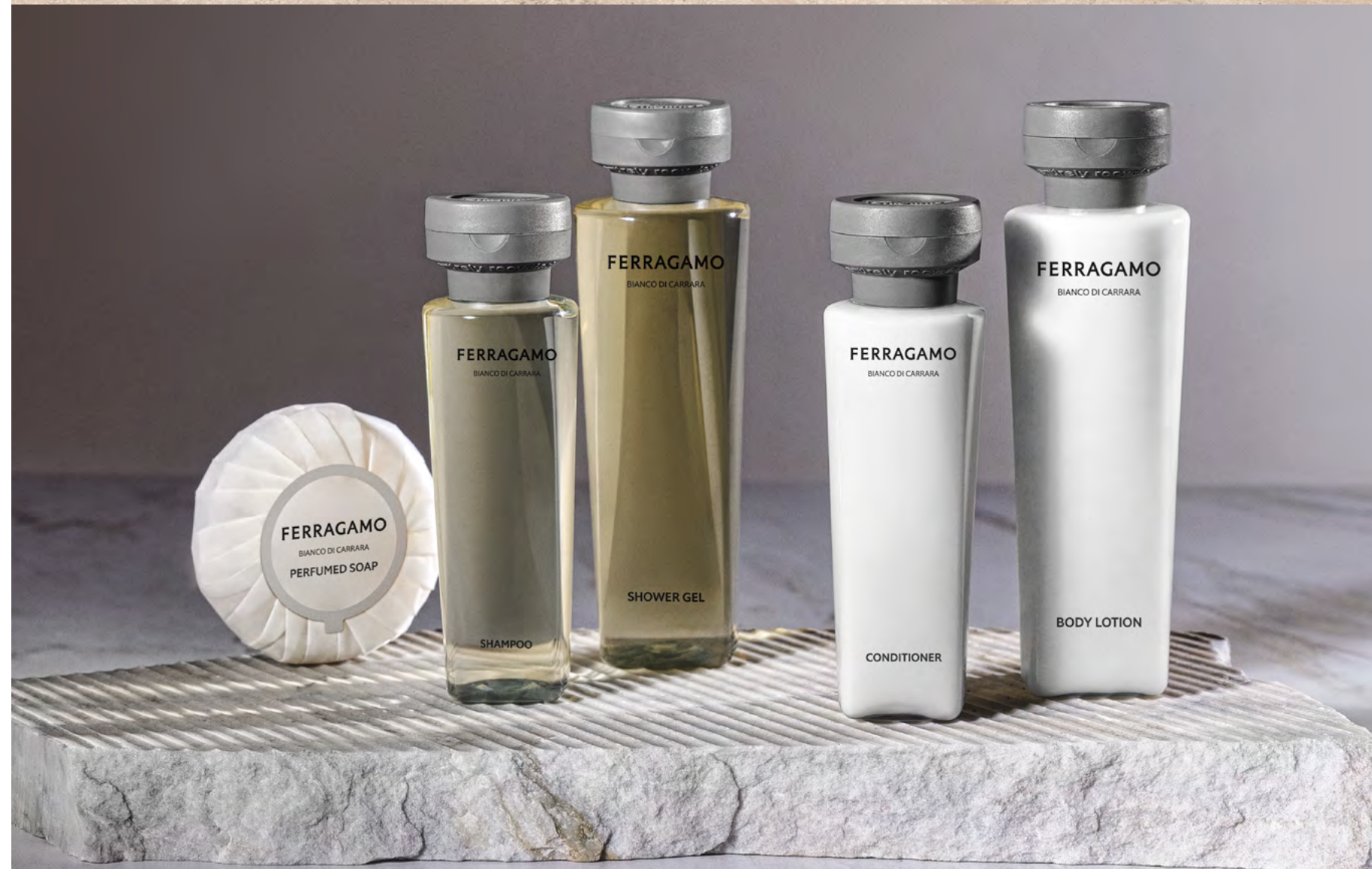
BIANCO DI CARRARA