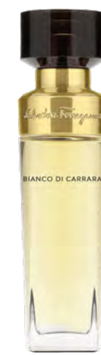
TRAVEL SIZE FRAGRANCE