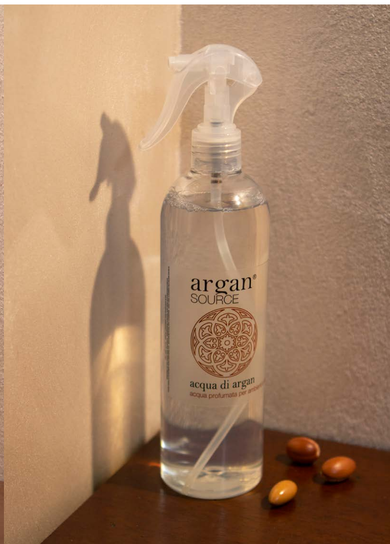
500 ml Scented water