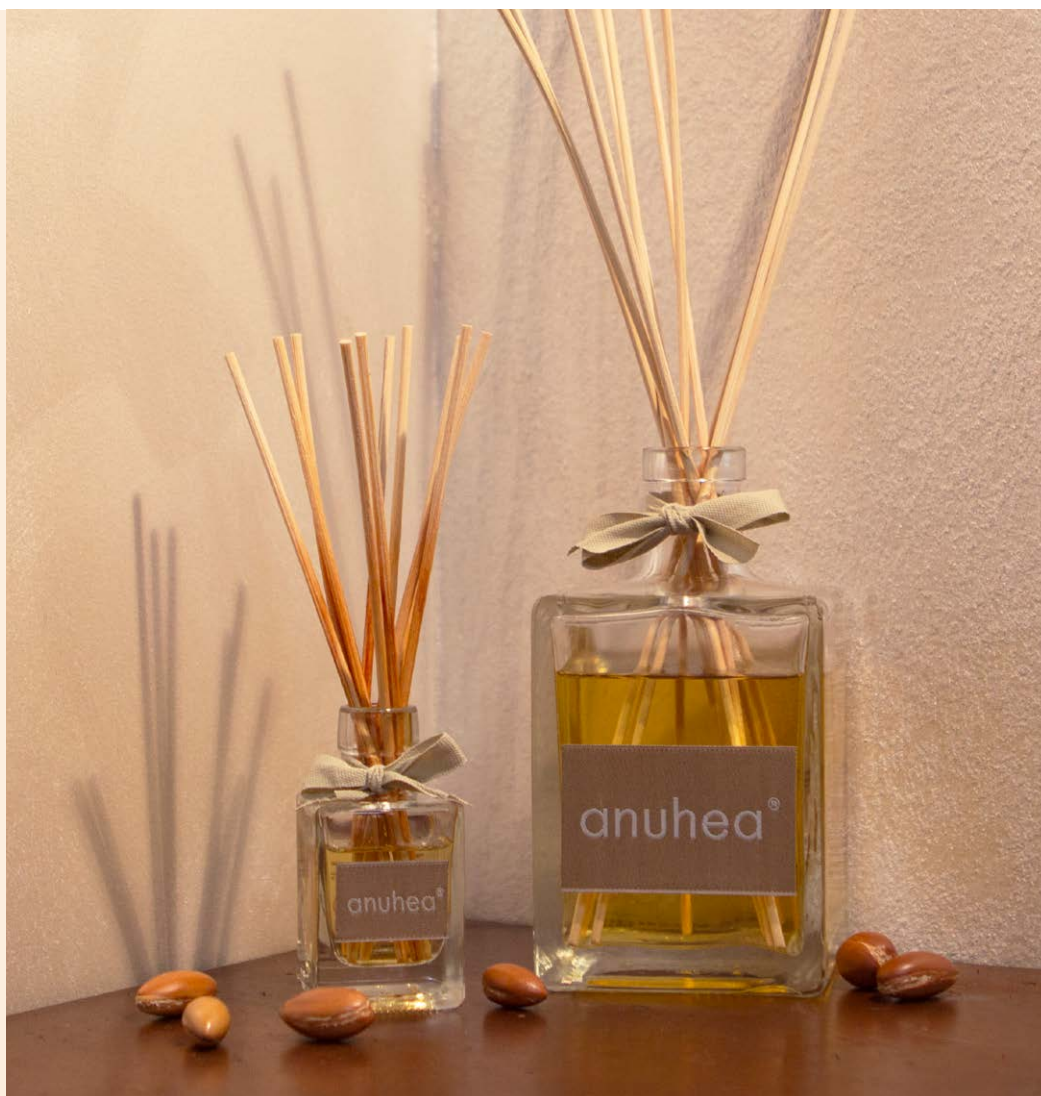
40 ml - 400 ml Room diffuser