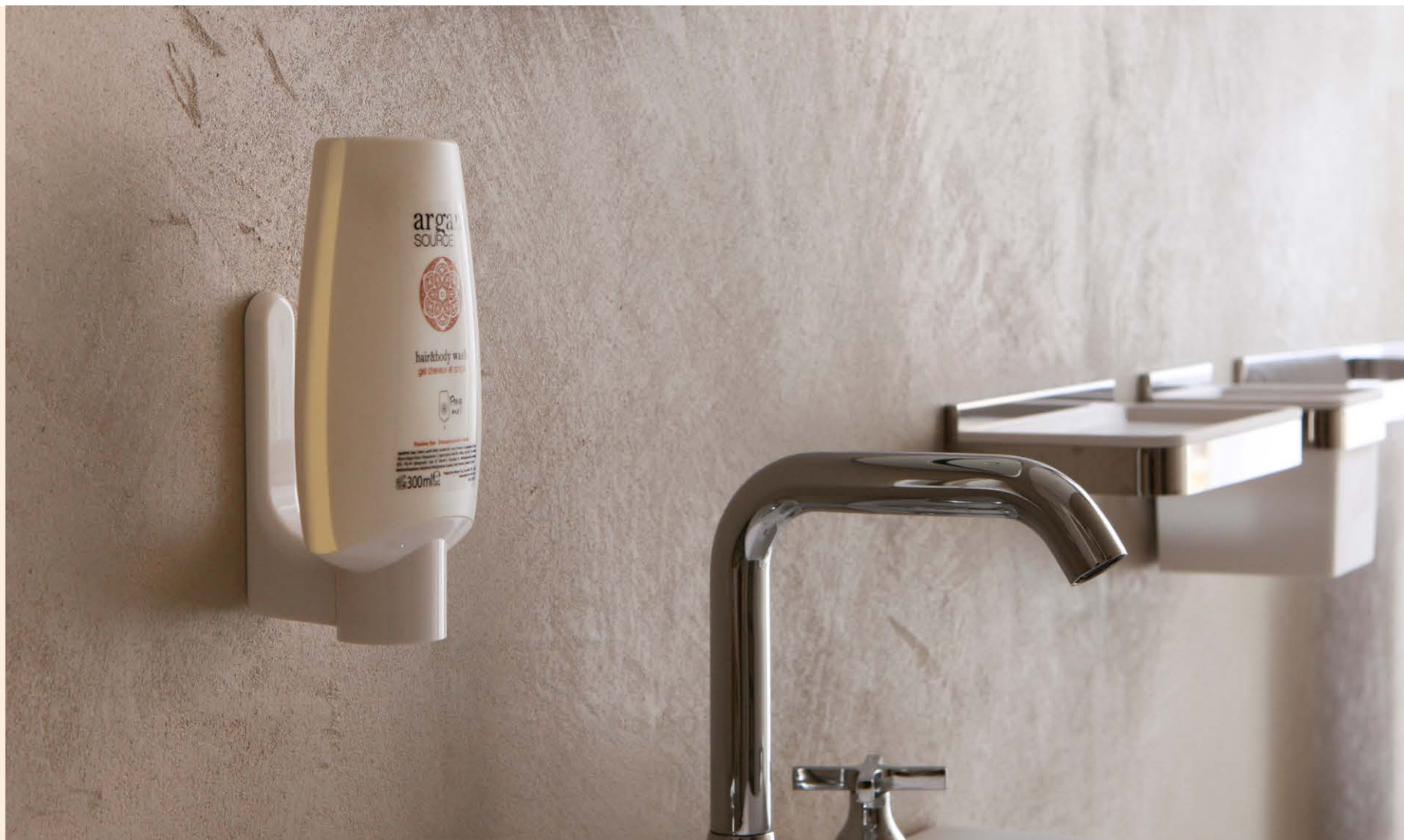
300 ml ConTatto