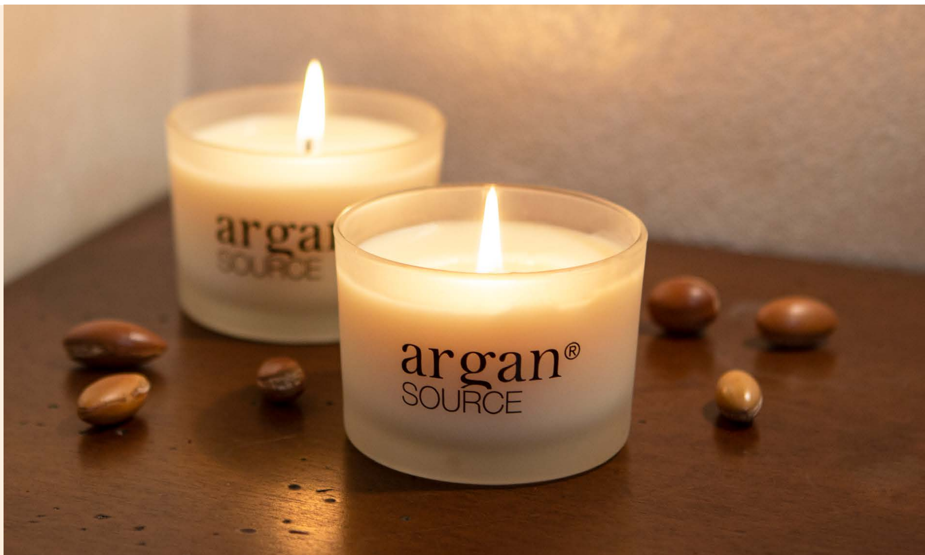
140 g Scented candle