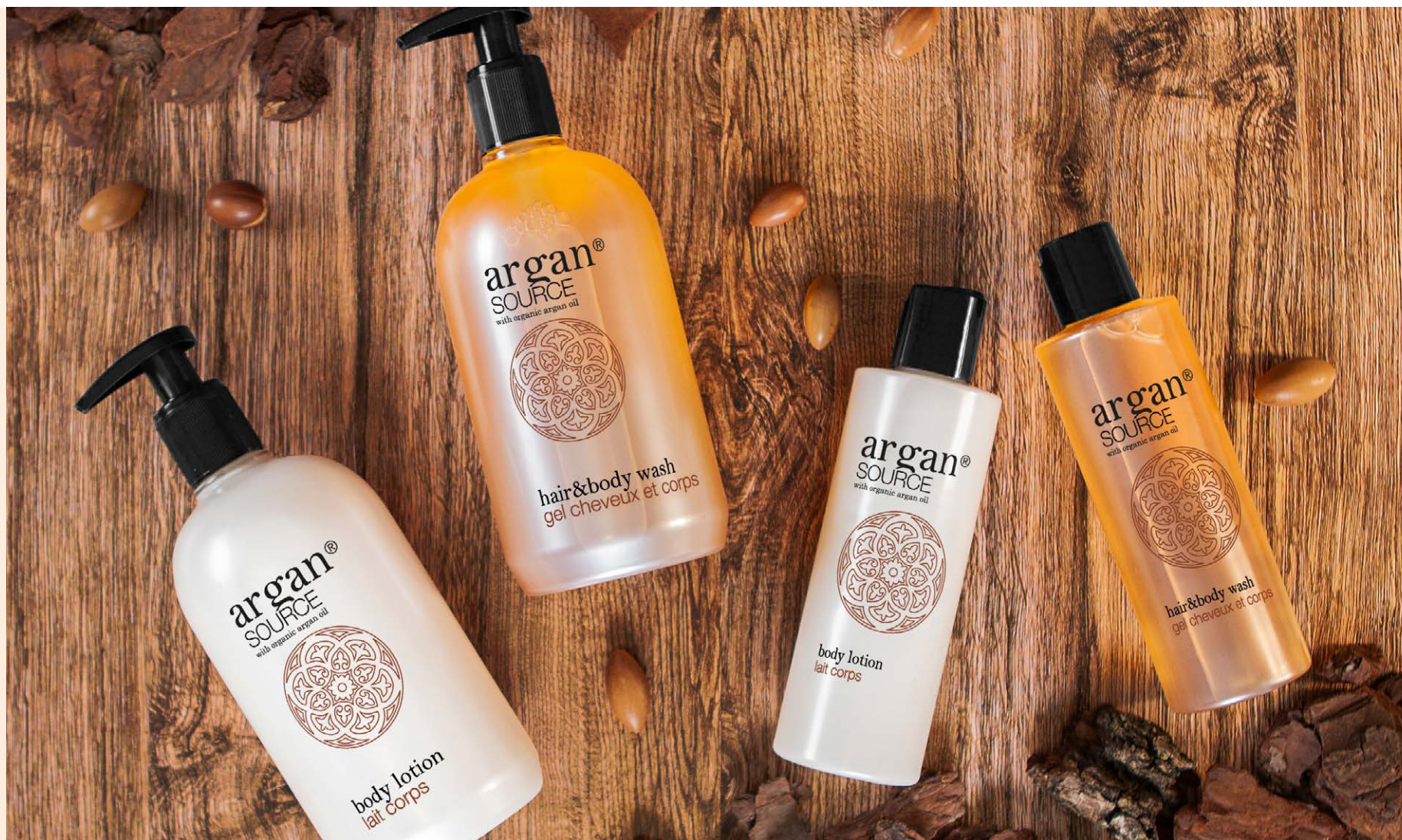
500 ml Dispenser - 200 ml Dispenser