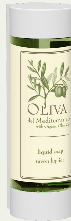
LIQUID SOAP 350 ml