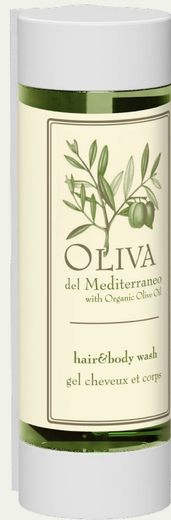
HAIR & BODY WASH 350 ml