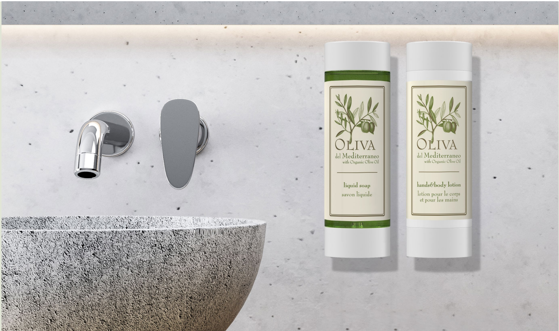
350 ml Trend Dispenser