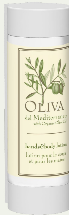
HANDS & BODY LOTION 350 ml