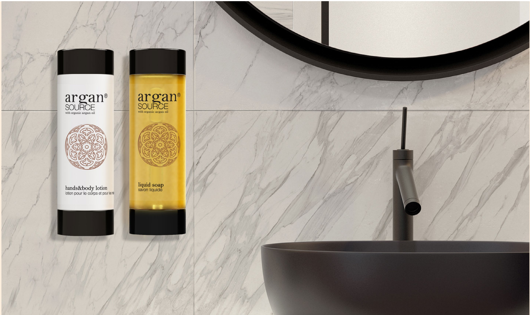
350 ml Trend Dispenser