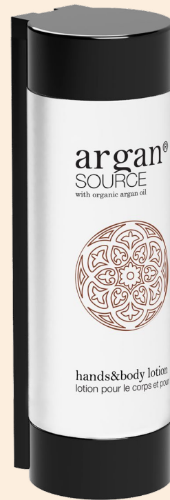
HANDS & BODY LOTION