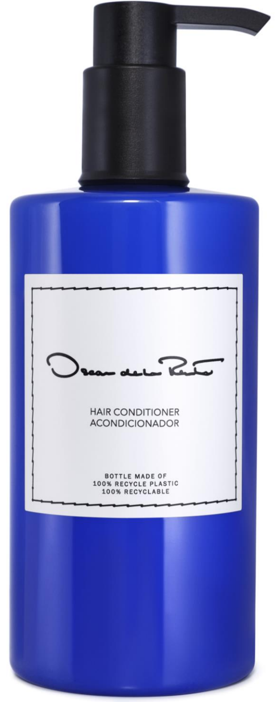
CONDITIONER 400 ML

Dispensers made in Post Consumers Recycled plastic. Dispenser are Recyclable