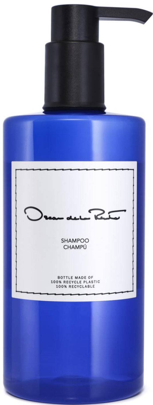
SHAMPOO 400 ML