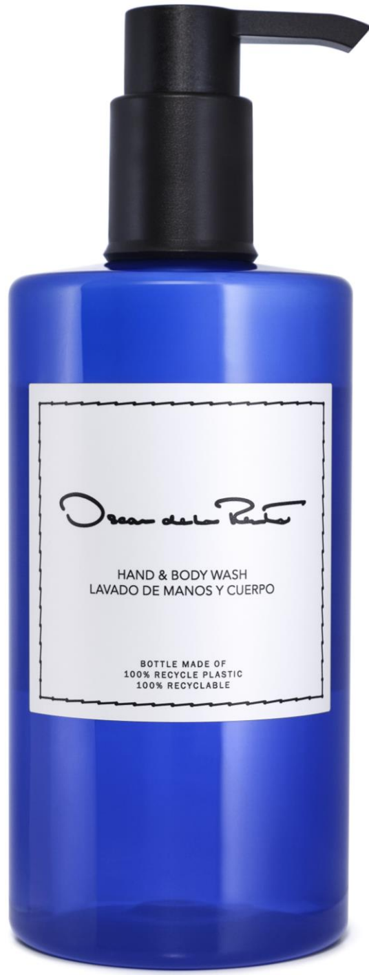
HAND & BODY WASH 400 ML