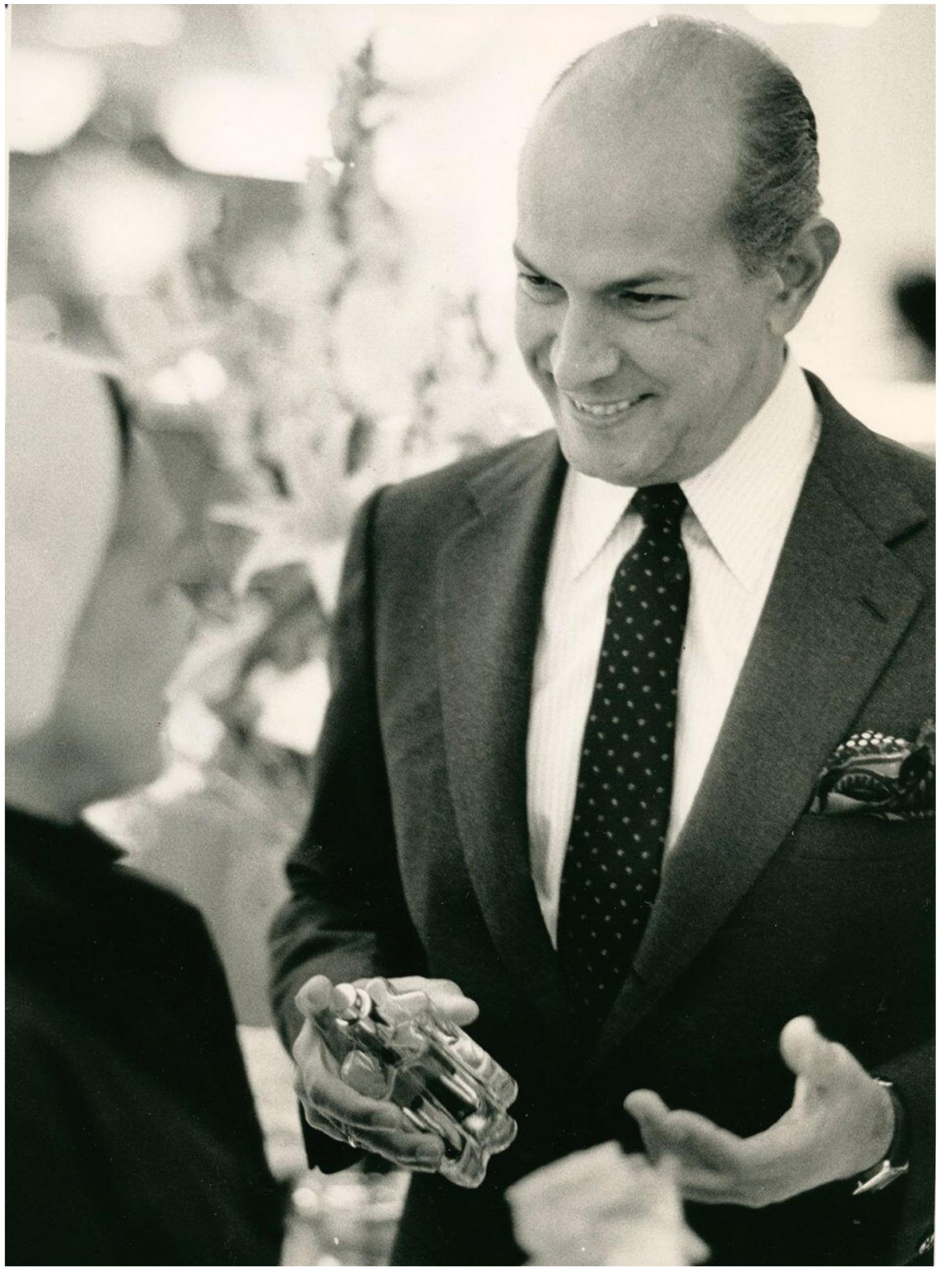
OSCAR DE LA RENTA A Legendary Fashion Designer