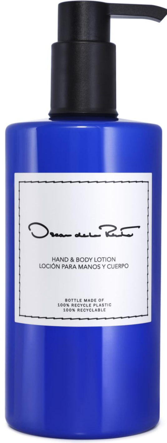
HAND & BODY LOTION 400 ML